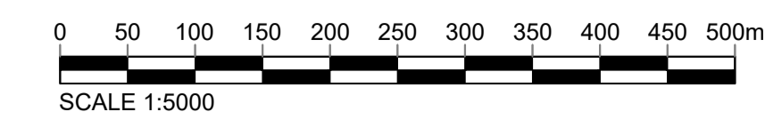
1 IMMINGHAM SITE LOCATION PLAN Scale: 1:5000@A1